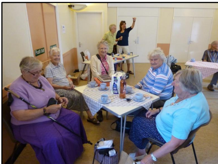
Members of the Evergreens enjoying the Coffee Morning in the village hall

Reading this edition, it will soon become clear how busy the village has been during the summer months (and much more is promised for the rest of the year). Activities enjoyed are many, but to mention some of the more popular:- the Evergreens are the most active group, who organise one or two events a month, and have enjoyed several outings: - the Dog Show,