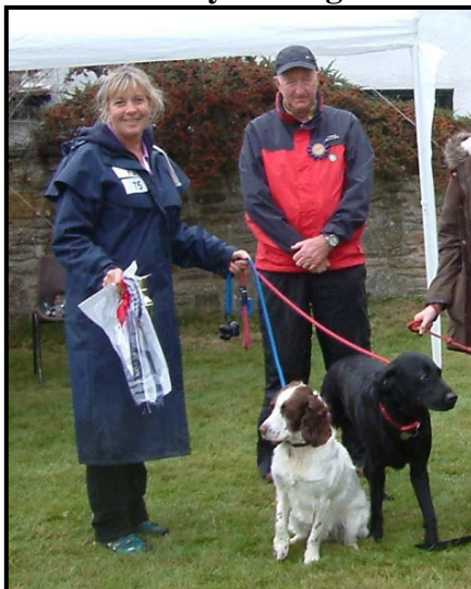
73 ROCK (English Spring Spaniel)