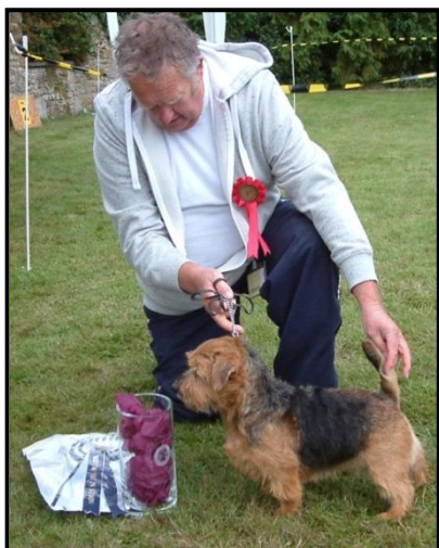
15 TODD (Norfolk Terrier)