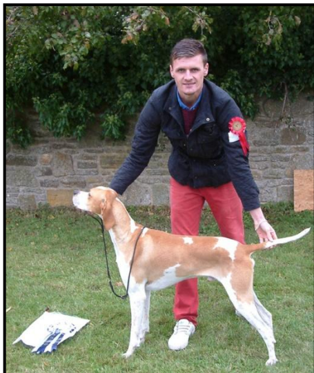
80 HARVEY (Pointer)