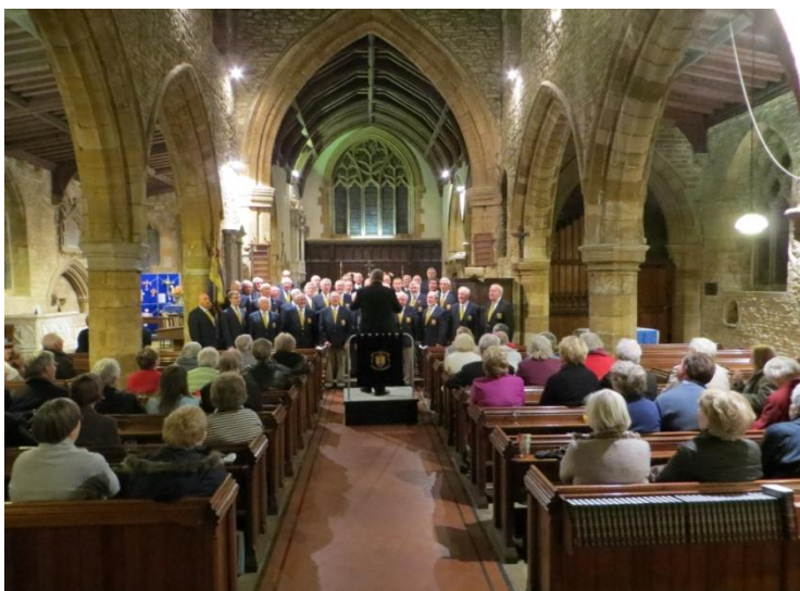
The church made a wonderful backdrop for the concert given by the Northampton Male Voice Choir