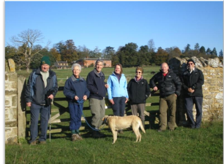
November Walk – on the Nene Way at Upton