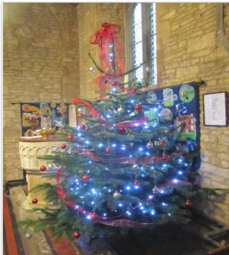
The Christmas tree in the church