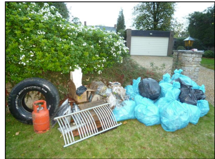
The huge amount of litter from Gayton streets awaits collection!

Several packages of IKEA brochures, and various other items of junk (see picture below)