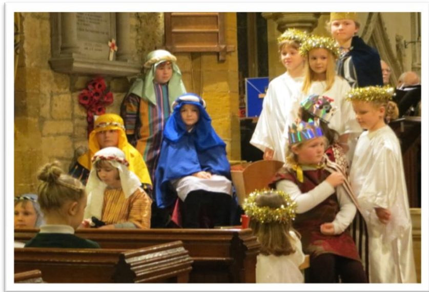
The school performs in front of a large audience.