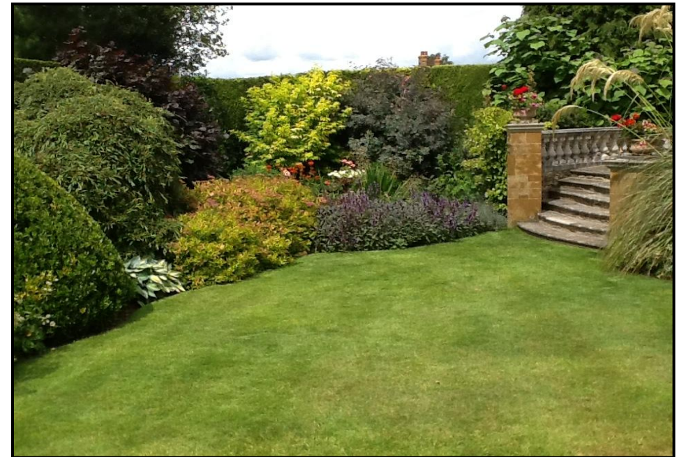
The Leedings' beautiful garden, one of six on view for Gayton's successful Open Gardens Day in July.