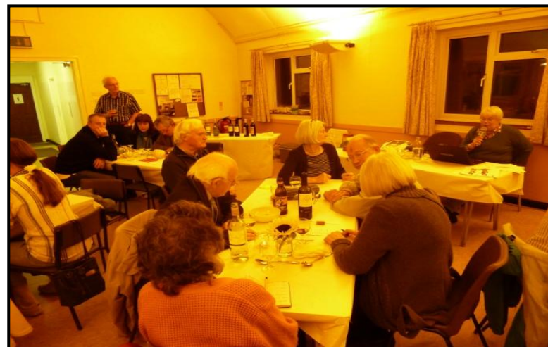
Competitors at the Harvest Supper and Quiz slog it out with the aid of a wonderful meal washed down with plenty to drink!