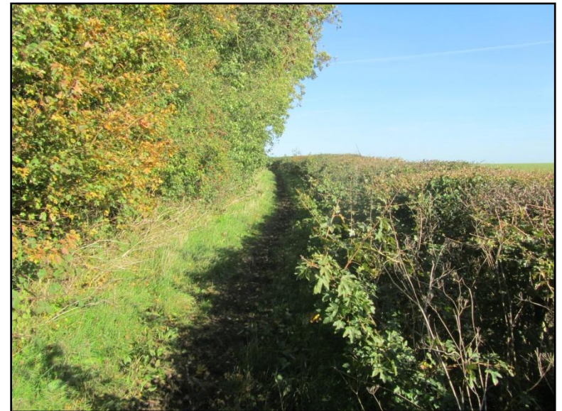
Bridleway SA14 runs from Eastcote Road down to Folly Farm near Tiffield