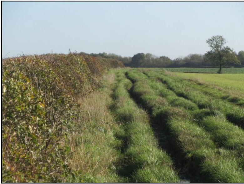
Byway SA9 runs from Eastcote Road across Gayton Wilds to Tiffield Pocket Park. The muddy ruts created by 4 x 4's can be surprisingly picturesque!