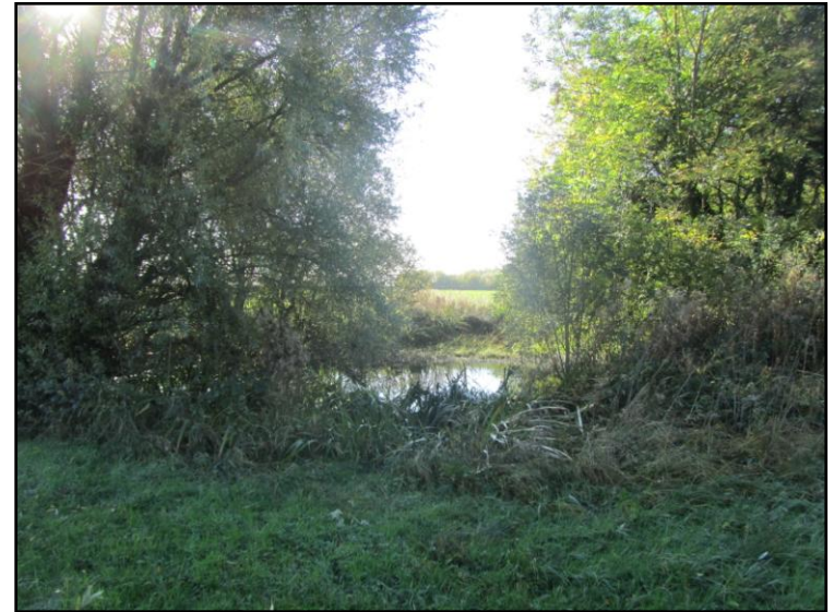
Footpath RL17 near Eastcote Road