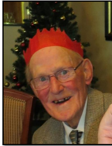
At the Evergreens Christmas party.