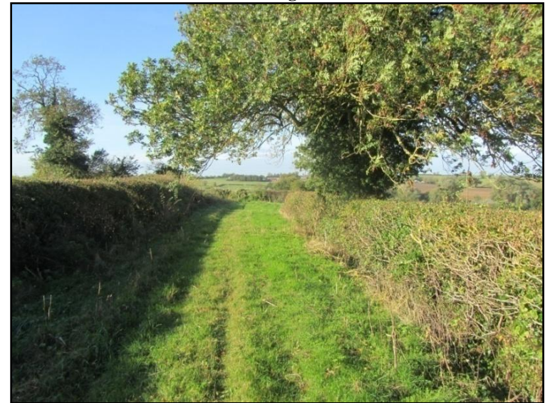
Footpath RL12 runs from Eastcote Road, behind Westgate to Goggs Farm and back to Eastcote Road at Old Wilds, wonderful views across the valley towards Banbury Lane !