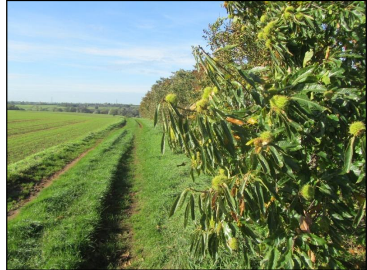
Roast chestnuts anyone! There was a bountiful crop on the trees lining footpath RL14 that runs from the Village Green towards Dalscote.

Pictures taken on 30 th October 2013, a glorious autumn day.