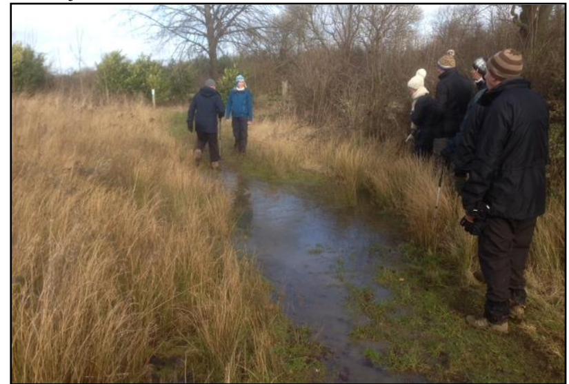
FEBRUARY 9 th Another nine intrepid walkers, plus Nero negotiate the flooded Midshires Way near Courteenhall, following heavy rain the previous night – but there was no rain during our walk! (Picture Rod Poxon).