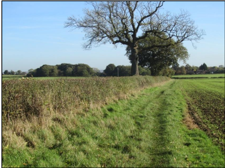
Footpath RL17 runs from Goggs Farm to Britain Cottages via Eastcote and Tiffield Roads.