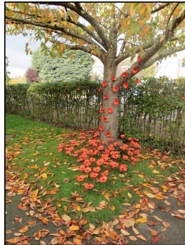
The beautiful Remembrance Day display at Gayton School similar to the Tower of London