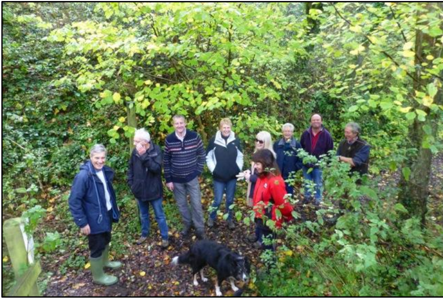
Tiffield Country Park, along the disused railway line.

The November walk was led by the Fosters and kept closer to home by walking to Tiffield via Folly Farm and coming back along the Tiffield Country Park/ Old railway line. We went further along the line into “jungle country” and then clambered up the embankment to join the path that comes out beside Britain Cottages.