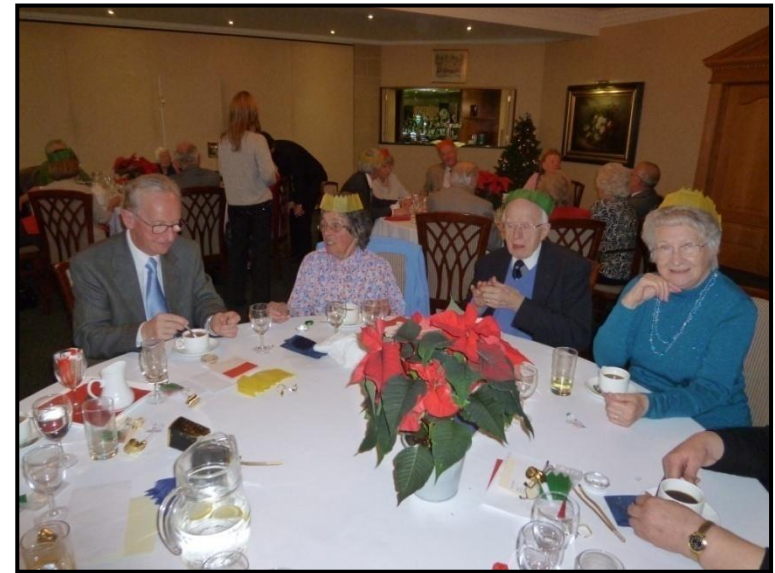
Christmas lunch at Whittlebury Park Golf and Country Club.