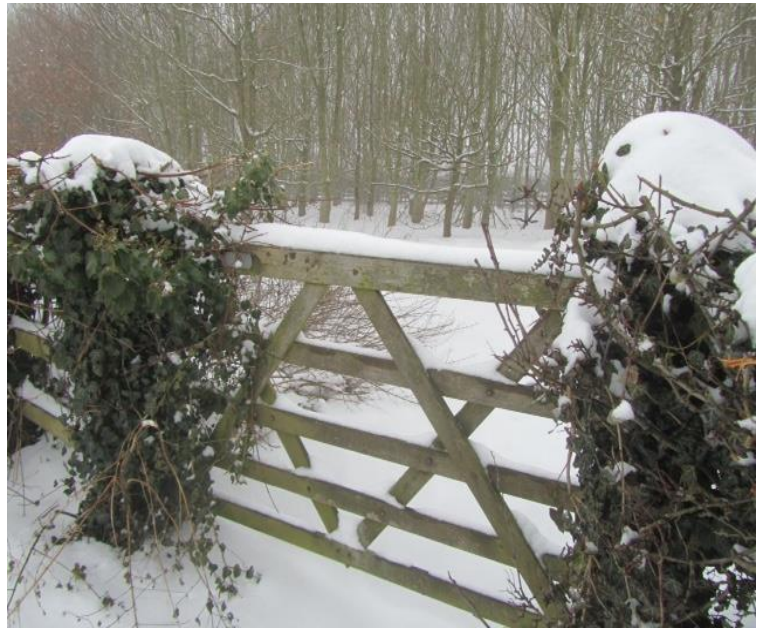
Super pictures of Gayton in the snow