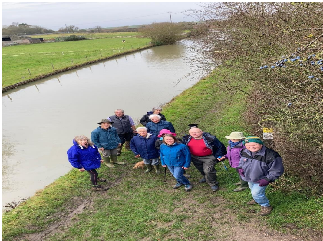
The Gayton Walkers on the canal towpath on New Year's Day