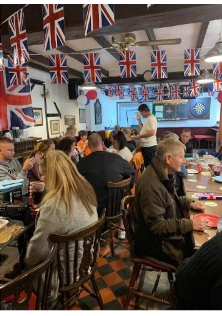
Although the Jubilee Celebrations were planned more for fun than fundraising, you managed to