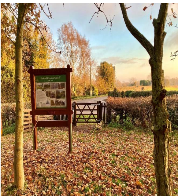
The Spinney now on this cold and frosty weekend, 2 December 2023.

Some of the faces featured in the 1999 pictures are sadly no longer with us, but the Spinney that they helped to create is a wonderful asset for the village and will hopefully continue to be maintained and cared for by present and future generations of Gaytonians.