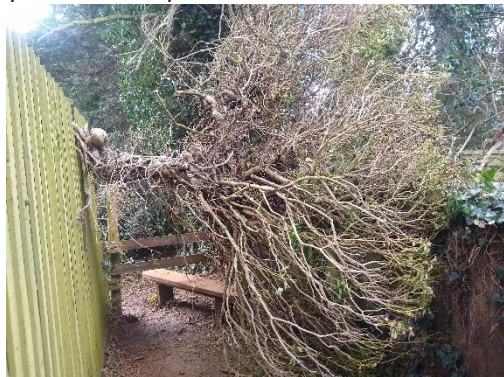
Tree down on RL14

If you think that you could help, please email your details to me and I promise not to expect you to do every session! <SMILE>