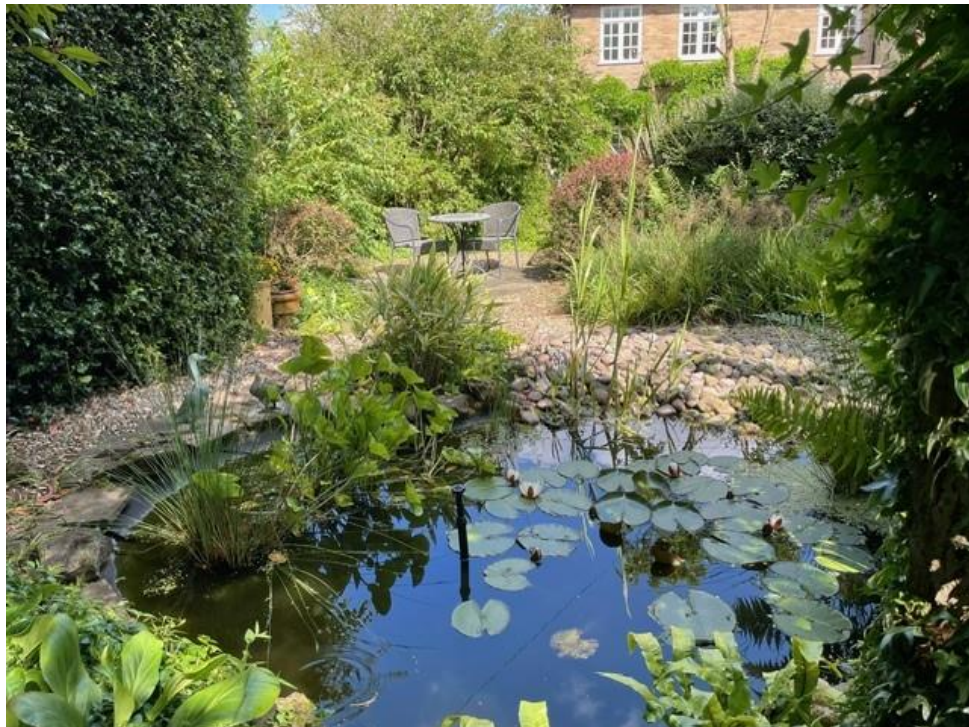
Jason & Tanya Auld's Garden

The total money raised for the church was £1008.20, which included a generous donation from the visiting gardening society.