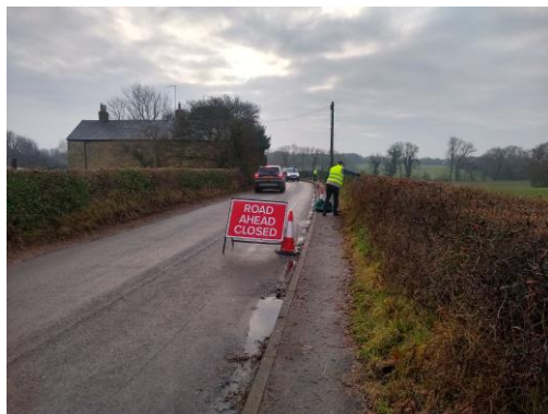
One of many visits to Blisworth Rd!

Previously in 2023, we built a stile on RL2 (Park Lane) and carried out about 10 workdays covering footpath & footway vegetation clearance.