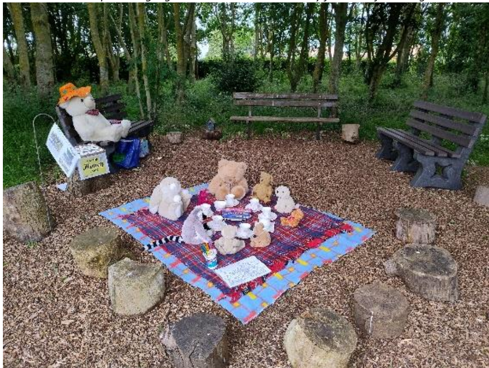
Teddy Bear's Picnic, Gayton Spinney