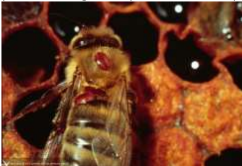
Varroa Mites on an adult worker bee

Varroa ( Varroa destructor ) is a tiny reddish-brown parasitic mite that attacks honeybees. Originally, from Asia, it spread worldwide during the 20 th C. and is one of the biggest problems facing beekeepers in the UK today.