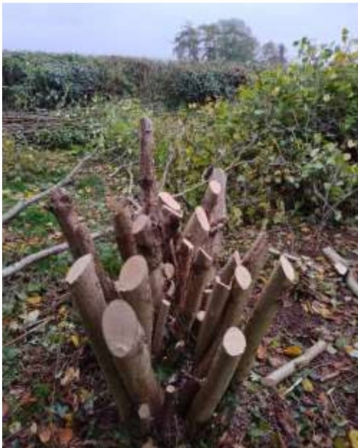
Hazel coppiced - Nov 2024

The Spinney always gets a bit overgrown this time of year, with April showers and sunshine enabling the weeds to flourish. We had our 1st tidy-up session cancelled due to the rain recently; I've tried tempting the volunteers with Jammie Dodgers but they are really not keen on working in the rain.