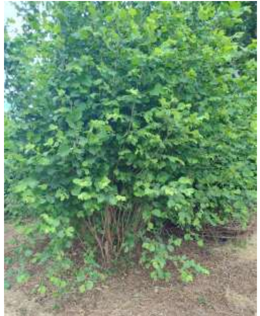
Hazel regrowth – May 2026

We have managed 1 tidy-up session so far where we have strimmed a lot of the weeds & nettles and dismantled 1 of the protective nests around the 1 st Hazel we coppiced back in November 2024. I was very surprised to see how much the tree had grown in 18 months.